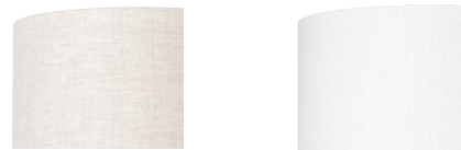
// Canvas // White