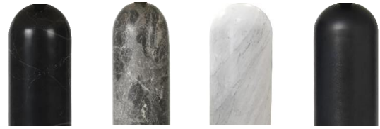
// Black marble // Grey marble // White marble // Blackened steel