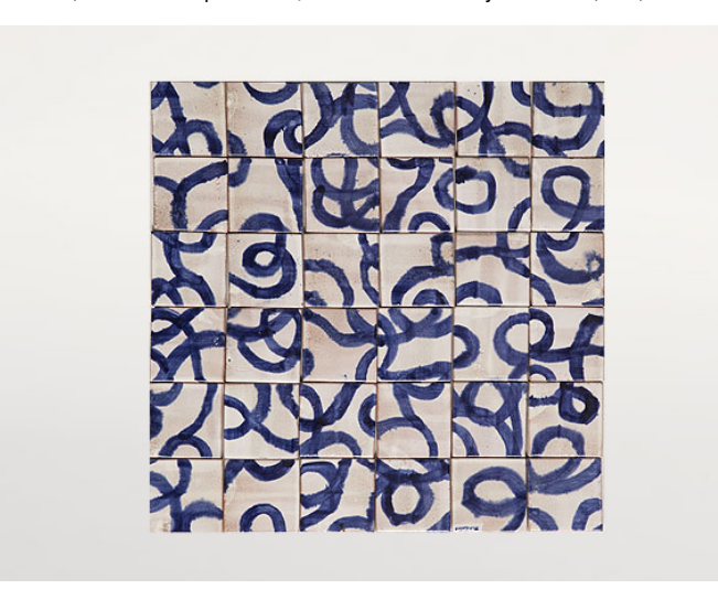
PML032, maiolica acquerellata/watercoloured majolica cm 7×7