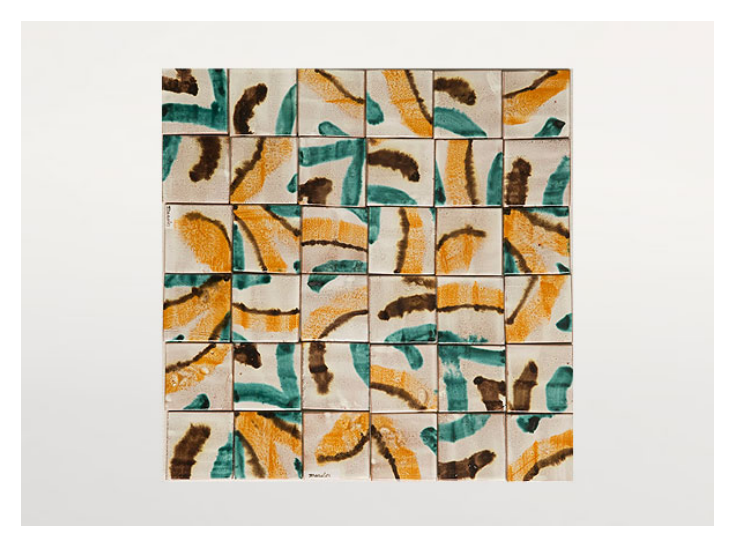
PML112, maiolica acquerellata/watercoloured majolica cm 7×7