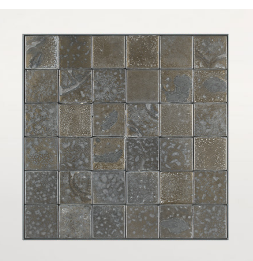
PMD121, majolica dipinta con colori ossidati/Majolica painted with oxidized colours cm 7\!\times\!7