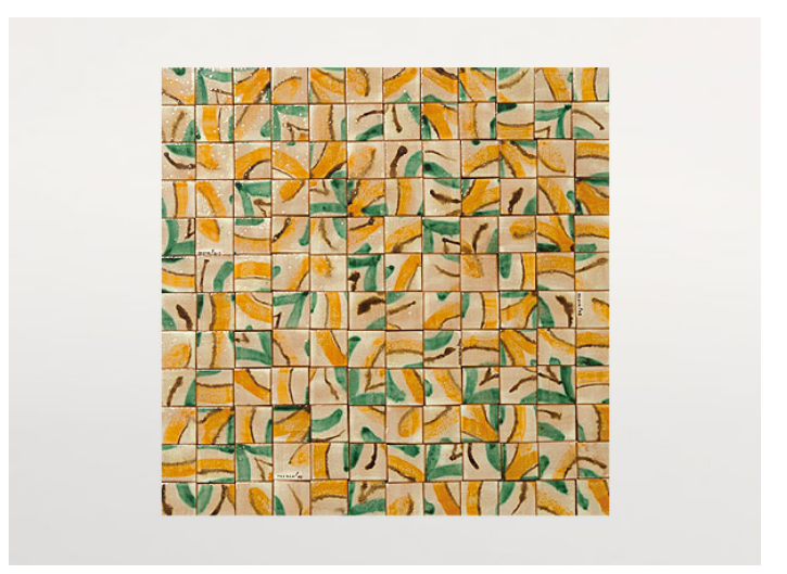
PMS112, maiolica acquerellata/watercoloured majolica cm 3,5×3,5