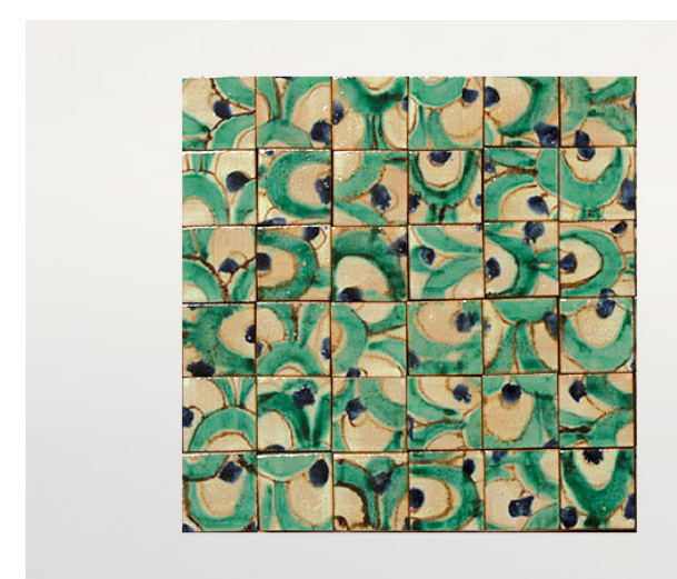
PML122, maiolica acquerellata/watercoloured majolica cm 7×7