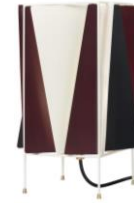
// Wine Red