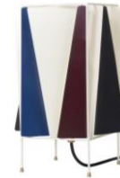
// French Blue