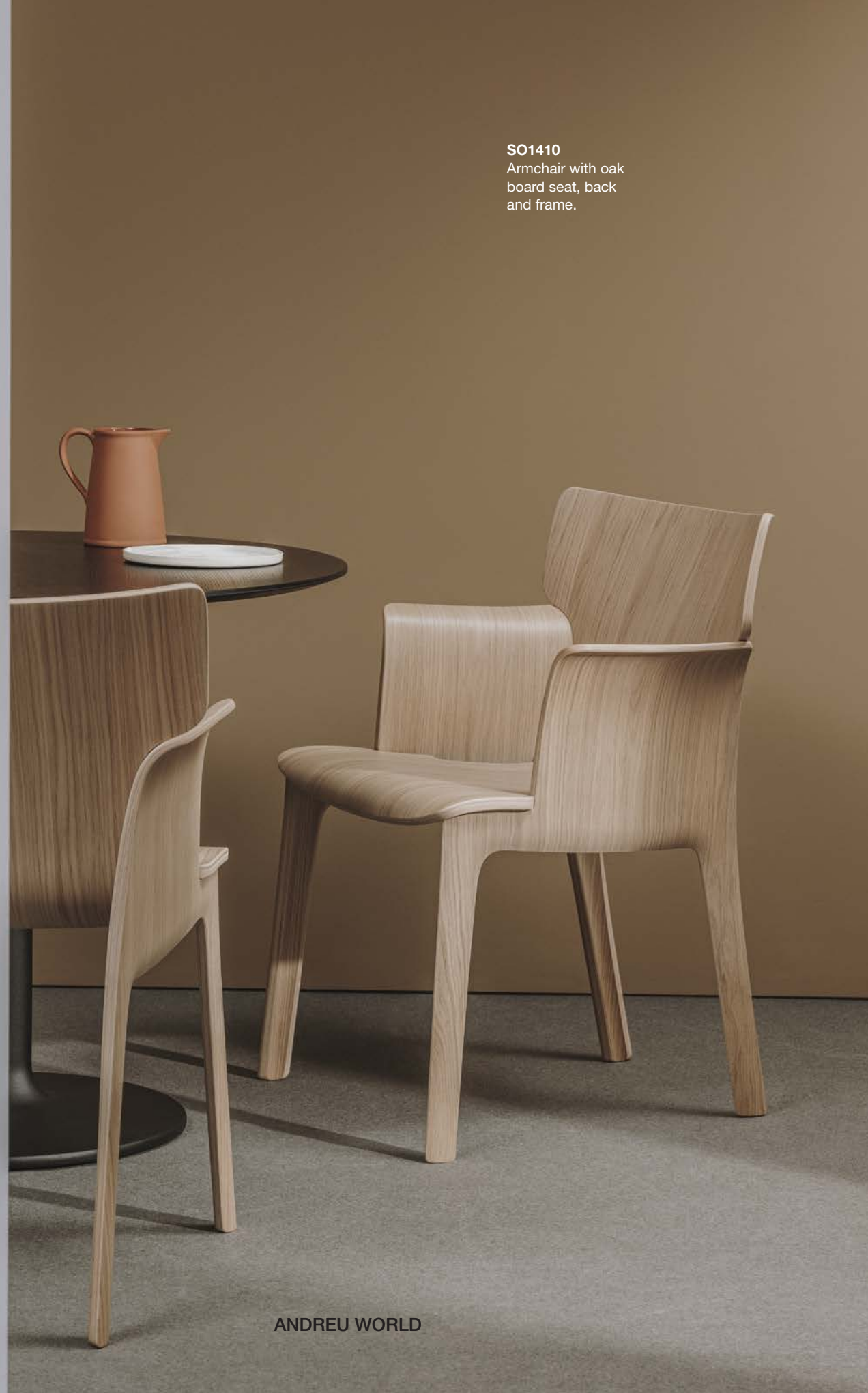
SO1410 Armchair with oak board seat, back and frame.